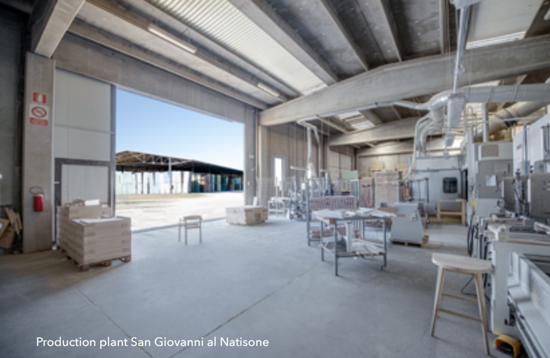
Production plant San Giovanni al Natisone